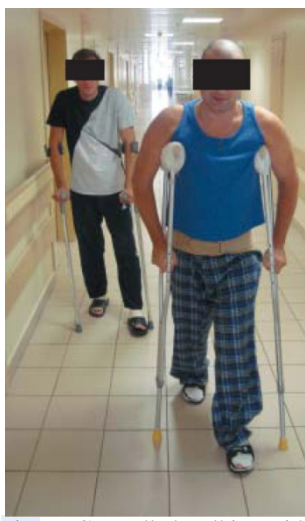
Fig. 6. Controlled walking with crutches