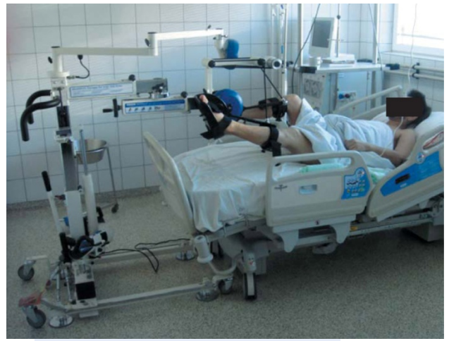
Fig. 4. Mechanotherapy in the intensive care unit