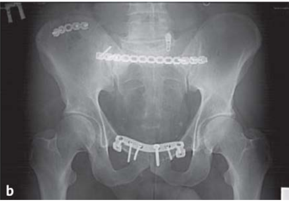
Fig. 1. Radiography image of the patient with unstable pelvic fractures: a - before surgery, b - after surgery