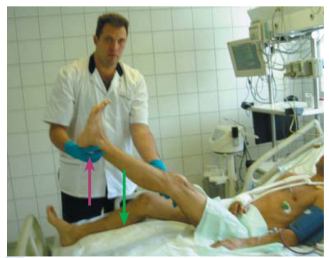
Fig. 3. Therapeutic exercises in the intensive care unit: 5th day after surgery