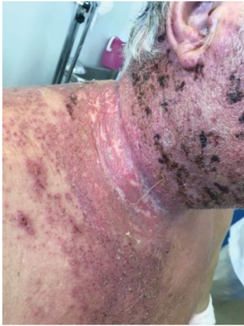
Fig. 5. A 65-year-old male patient S., 5th day after contact with hogweed juice during treatment

Upon admission to the hospital, all for patients with PD painkillers, antihistamines were prescribed, and hormones were administered if indicated. The volume of infusion therapy and its duration were determined depending on the degree of intoxication. For patients with signs of wound infection antibacterial drugs were indicated.