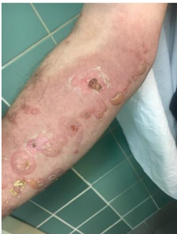
Fig. 6. A 34-year-old male patient V., 3rd day after contact with hogweed juice

On the 5-7th day, in the absence of wound infection, after a complex of local treatment, edema decreased, and active independent marginal and insular epithelialization was observed (Fig. 6, 7). In 11 patients, with the development of purulent-necrotic complications, spontaneous healing occurred by secondary intention on average on the 14-18th day.