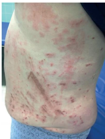
Fig. 7. A 55-year-old male patient T., 4th day after contact with hogweed juice during treatment

In all patients, dark pigmented areas remained at the sites of healed lesions.