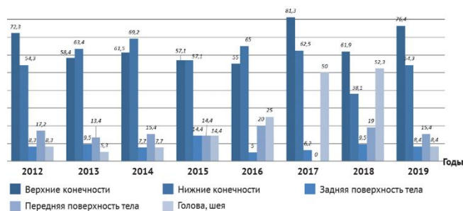
Fig. 2. Location of skin lesions in patients with photochemical dermatitis due to contact with hogweed juice

Upper and lower extremities were involved most often, then - the anterior and posterior surfaces of the body, head and neck (Fig. 2).