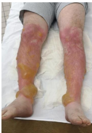
Fig. 4. A 25-year-old male patient V., 2nd day after contact with hogweed juice

In 11 patients who self-medicated at home and sought medical help on the 6-10th day after contact with hogweed juice, purulent-necrotic complications were observed during the wound process, which was manifested by erosion of surfaces, serous-purulent discharge and areas of thin dry necrosis (Fig. 5). Patients in this group had significant manifestations of intoxication (hyperthermia, headache, dizziness, chills, moderate leukocytosis).