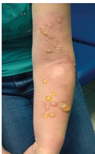
Fig. 3. A 28-year-old female patient P., 2nd day after contact with hogweed juice

The first signs of local skin lesions did not appear immediately, but several hours or even 2 days after contact with the plant juice. According to the patients, at first there was skin hyperemia with clear boundaries, then small thin-walled blisters appeared, which subsequently merged into large blisters (Fig. 3). This was accompanied by significant edema of the surrounding tissues. The blisters were tense, thick-walled, filled with transparent serous contents (Fig. 4). It should be noted that in the presence of preserved blisters, the patients did not notice painful sensations; subsequently, when their integrity was violated, severe pains appeared, increasing when touching the wound, which was accompanied by itching and burning. It is noteworthy that the formation of bubbles occurred over several days, and not all at once. Along with this, some patients noted headache and dizziness.